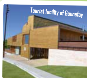
Tourist facility of Gounefay