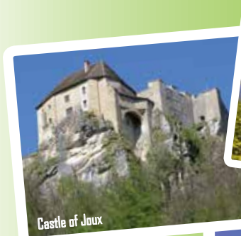
Castle of Joux