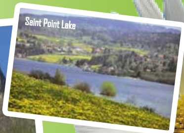
Saint Point Lake